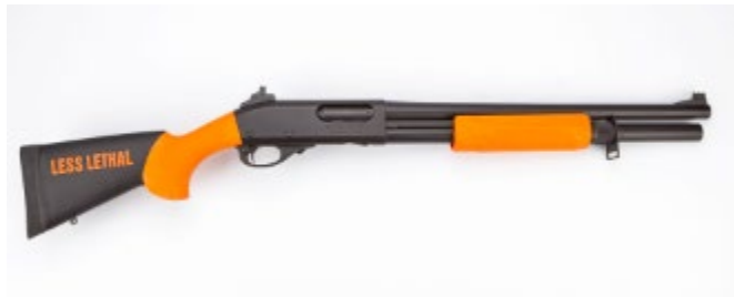
Less Lethal Combat Shotgun (pictured above)

Manufacturer Description: The Remington 870 Police pump-action shotgun is a rugged 12-gauge with a short, tactical 18" barrel backed by a stout 3" chamber. The all-matte black gun is Parkerized for generalized durability and rust-resistance. Both the pump action forend and stock are robust and tough synthetic.