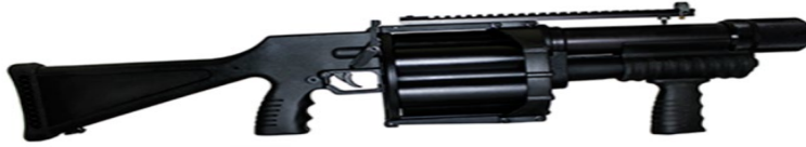
Penn Arms PGL 65-40 (pictured above)

Manufacturer Description: A 40mm pump-action advance magazine drum launcher with a fixed stock and combo rail. It has a six-shot capacity and rifled barrel. Previously labeled the PGL-65, the features include Double-action trigger, trigger lock push button and hammer lock safeties.