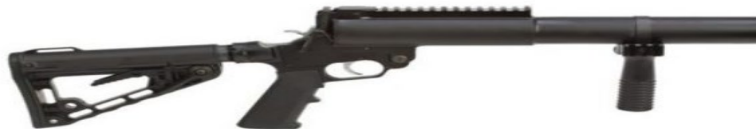
40mm Single Launcher (pictured above)

Manufacturer Description: Rifled barrel, Breech fed, Double action/single action, Picatinny rail.