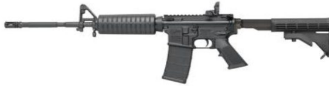
Colt LE6920 (Pictured above)

(Description and photo source) https://www.colt.com/detail-page/colt-le6920-carbine-223556-161-301-pmag-mbus-4-pos-stblk