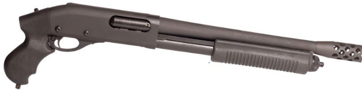
Remington 870 Police Magnum (pictured above)

Royal Arms Breaching Barrel: For Remington 870/1187 Shotguns; We use only high-Quality Factory replacement Barrels. All Barrels we use for the Remington 870 are cylinder smooth bore Police Model. Parkerized. The breacher is locked onto the external threads of the Barrel making it permanently affixed and part of the O.A.L. Specified by ATF. Made from 4140 Mil Spec Chromoly Steel Heat Treated to 56 RC to with stand years of abuse. The 12 Point allows a positive grip on all surfaces since the Serrated teeth are spread across the entire contact area of the breacher standoff.