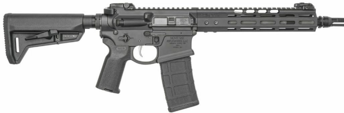
Noveske N4 (pictured above)

Gas Operated Semi-Auto, Air cooled Magazine feed, Barrel Length: 10.5", stainless steel, Chambered in 5.56, Capacity: 30+1