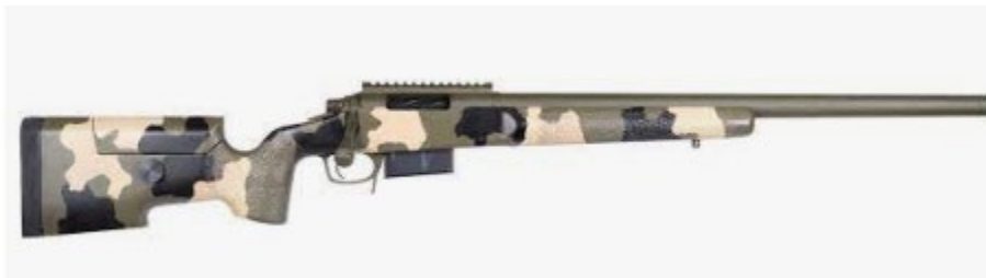
GA Precision Bolt Action .308 Win Rifle – base model (pictured above)

The rifle is a custom GA Precision product built for Oakland PD, based on their Crusader model. It is built off of the Remington 700 short-action receiver platform, but manufactured and outfit by GA Precision, using a variety of components from different manufacturers. The barrel is manufactured by Broughton; it is 22" long, fluted, and has a 1/11.25" twist. The rifle stock is manufactured by Manner. The trigger group is a custom build by GA Precision. The scopes are manufactured by Nightforce (NX8), with Badger Ordnance scope rings and bases. The bipods are manufactured by Harris. The rifles were built from different components but serialized under GA Precision.