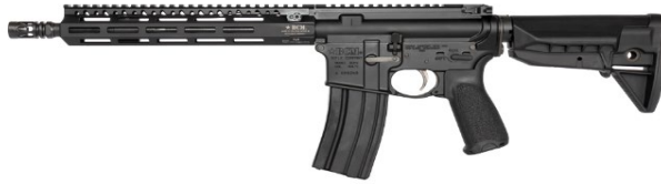
BCM CQB MCMR 11 (pictured above)